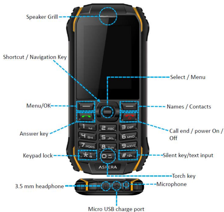
Aspera R32 Front