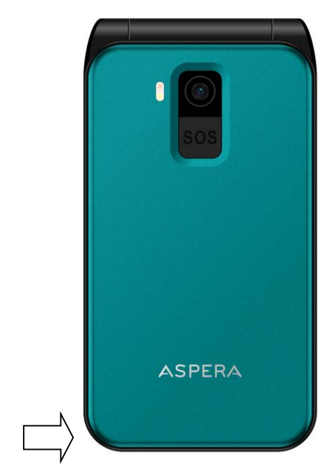
Lift from indent at back left corner